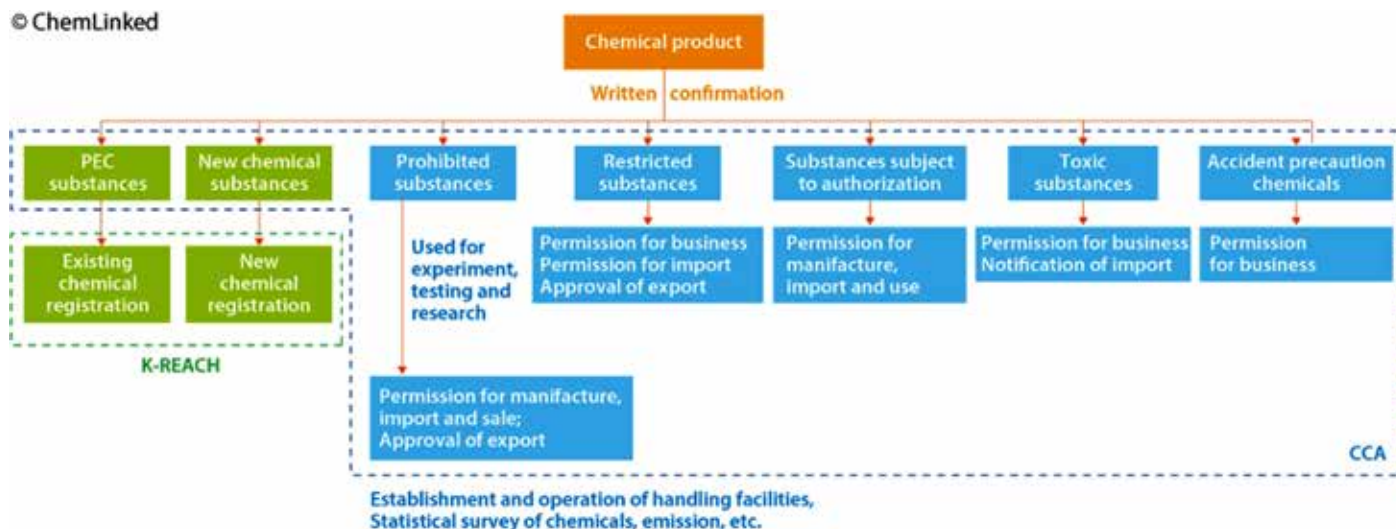
(Graph by ChemLinked)

The Korean Chemical Control Act (CCA) , similar to K-REACH, was divided from TCCA and came into force on 1 January 2015. While K-REACH focuses on chemical registration, CCA focuses on the life cycle of chemical products, from market and distribution to handling and disposal. It requires manufacturers or importers to submit a “Written Confirmation of Details for Chemical Product” to Korea Chemicals Management Association (KCMA) before manufacture or import after self-evaluation of whether it contains any seven regulated chemicals in the following graph and follow up action is needed if any of those chemicals are contained. There are also other requirements for off-site impact analysis and risk management plan etc. The MoE will issue a business permit for hazardous chemical substances when the necessary standards are met.